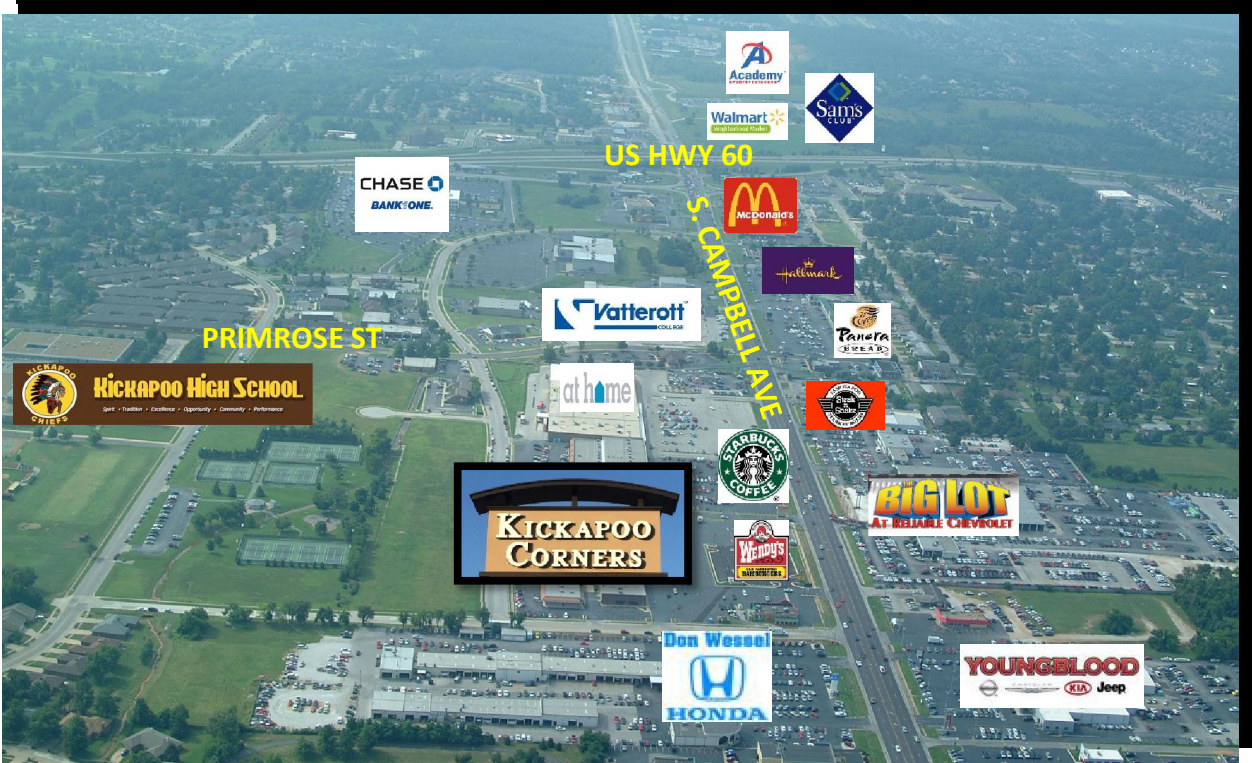
Kickapoo Corners View to the South